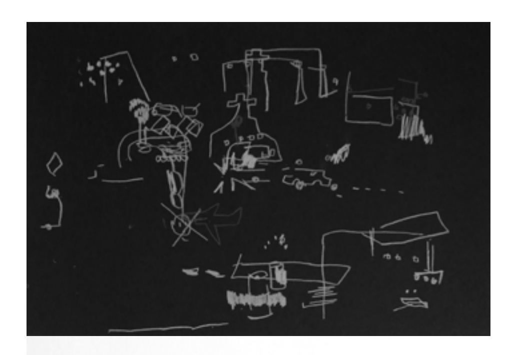
Mostel, dux, Netopyon, Masic, Blid Rive, laska, cit, Nadej i baznadej škola, Rive, Shranky, Portes Minulost